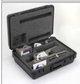
Complete Radio Ohmstik Kit